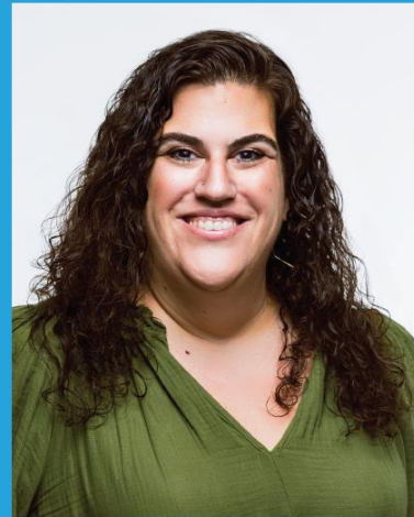
Senior Director, Executive Office