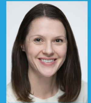
Senior Director, Program (Quality)