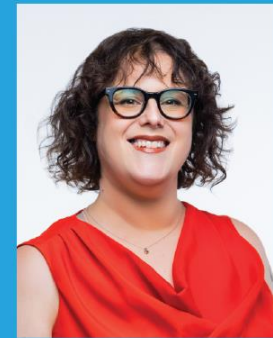
Senior Director, Program (Access)