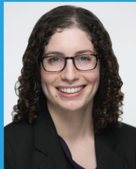
Senior Director, Program (Equity)