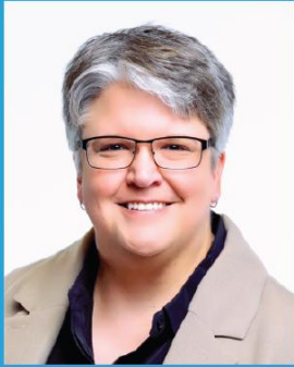
Vice President & Senior Counsel