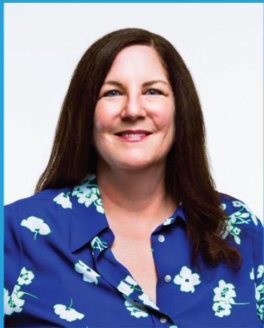
President & CEO