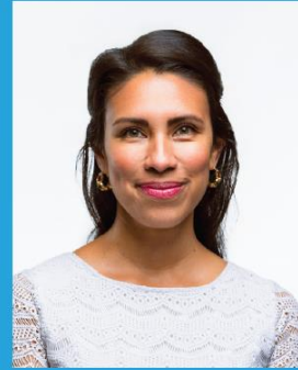
Vice President, Program