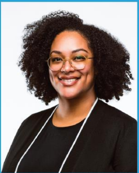
Senior Director, Program (Equity)