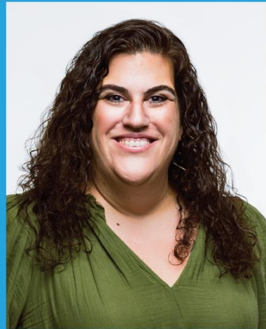
Senior Director, Executive Office