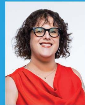
Senior Director, Program (Access)