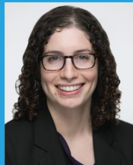
Senior Director, Program (Equity)