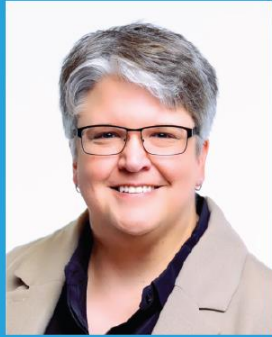
Vice President & Senior Counsel