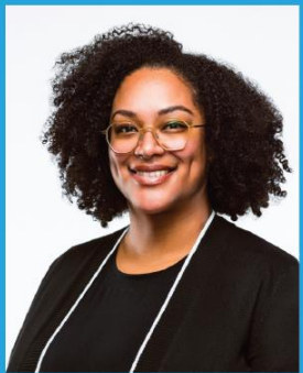
Senior Director, Program (Equity)