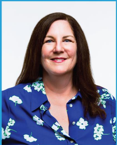
President & CEO