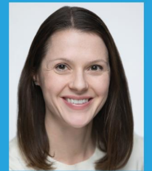
Senior Director, Program (Quality)